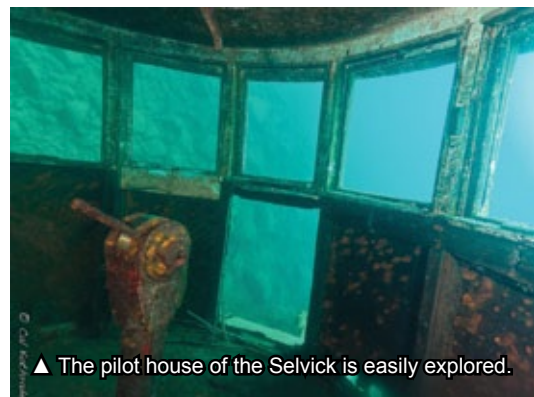
▲ The pilot house of the Selvick is easily explored.