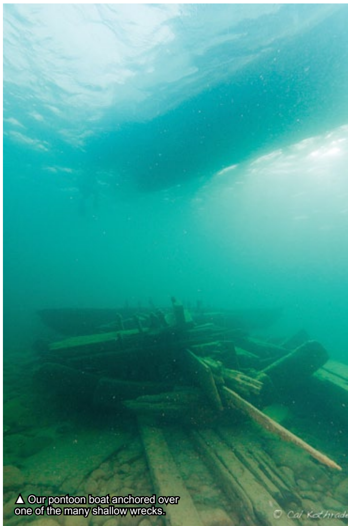
▲ Our pontoon boat anchored over one of the many shallow wrecks.