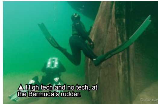
▲ High tech and no tech, at the Bermuda's rudder.

park offers spots for tents, campers and RV's along the pristine sand beach where you can swim, snorkel, shore dive (to about 60 feet deep) or just hang out while beating the heat. Clean bathrooms and showers are on site, as is free WI-Fi, electricity, and water hook ups for campers. If camping isn't your speed, there are several lodging choices in and around town ranging from budget minded to quite nice! Our group consisted of seven divers, so we opted to rent two boats from the friendly folks at Seaberg, and kept them overnight with the intention of doing a morning dive the day of our departure. Mother Nature altered our final day plans though, kicking up some nautical conditions, and our last day rental was refunded to us without us asking. We beached the boats literally seventy-five feet from our campsite, making for hassle free loading and unloading of gear. The provided anchors were well placed on the shore to keep our rentals safe overnight.