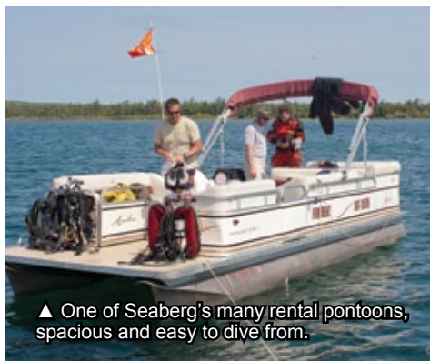
▲ One of Seaberg's many rental pontoons, spacious and easy to dive from.