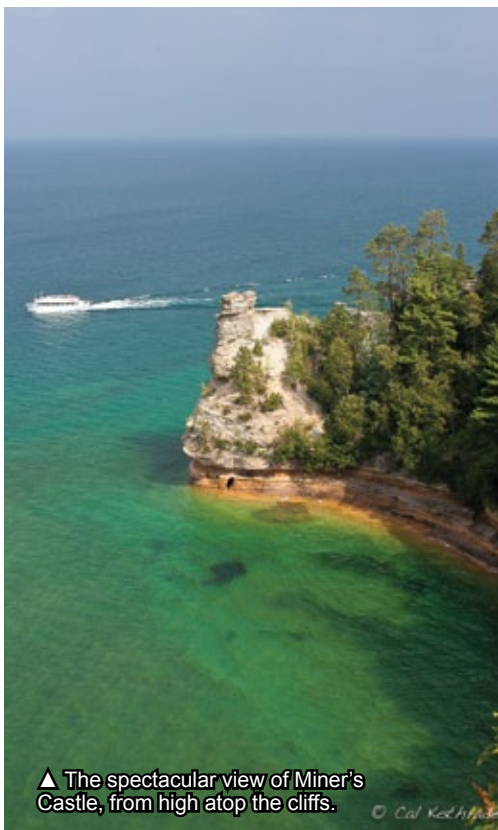
▲ The spectacular view of Miner's Castle, from high atop the cliffs.

There are more than thirty wrecks in the immediate vicinity, some shallow, some deep, and some currently buried under the ever shifting sands of Lake Superior's picturesque shoreline. With boat rentals, dive charter boat services, and dive shops for your fills and gear needs all right there, Munising is a fantastic dive destination for folks watching their budgets, or looking for a nearby place to enjoy a long weekend. Snorkeling, free diving or diving on some shallow, sunlit, warm water Great Lakes Wrecks is easy here in the Zebra Mussel free waters of late summer Lake Superior. ■