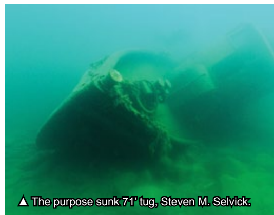
▲ The purpose sunk 71' tug, Steven M. Selvick.