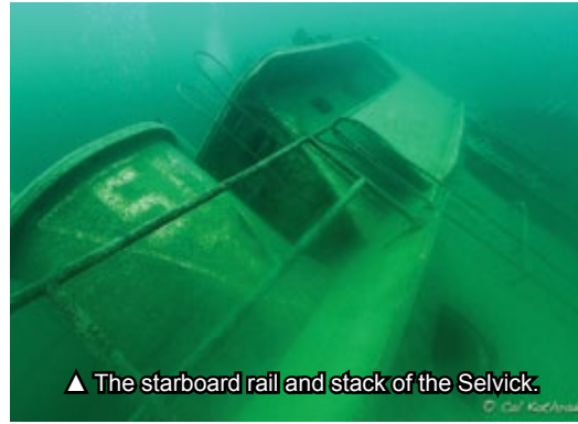
▲ The starboard rail and stack of the Selvick.